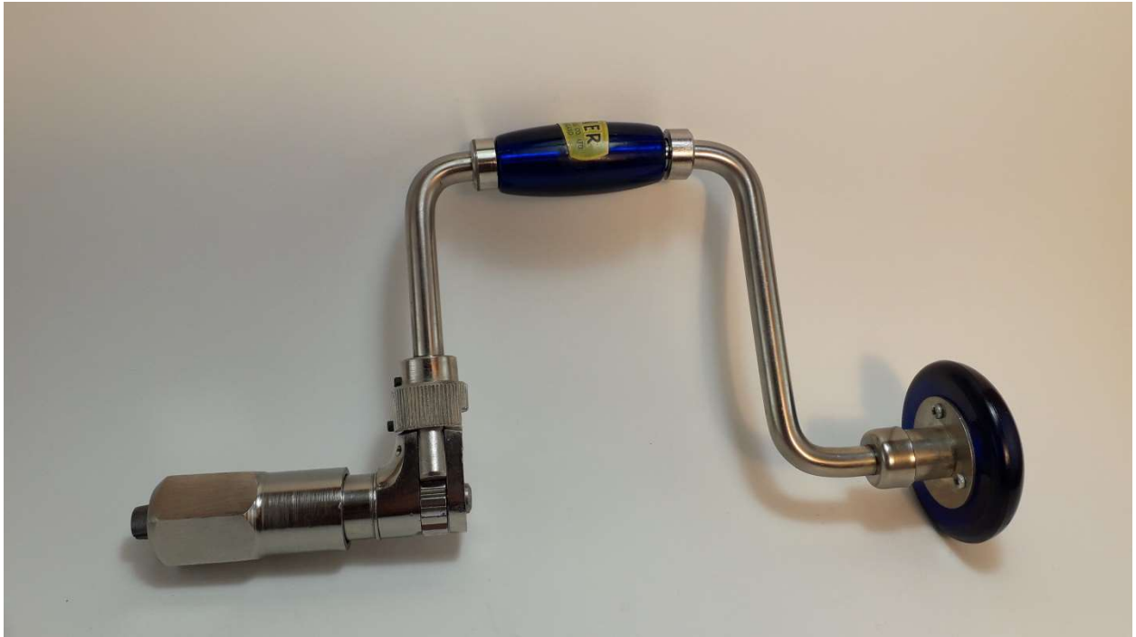
Another colour of cellulose acetate. This example is unused and in excellent condition.