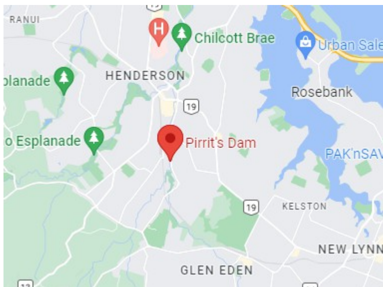
Fig.10. Location of Pirrits Mill and dam. Millbrook Road Reserve, Millbrook Road, Henderson.

Fig.9. George Pirrit tried to let the factory prior to listing it for sale.