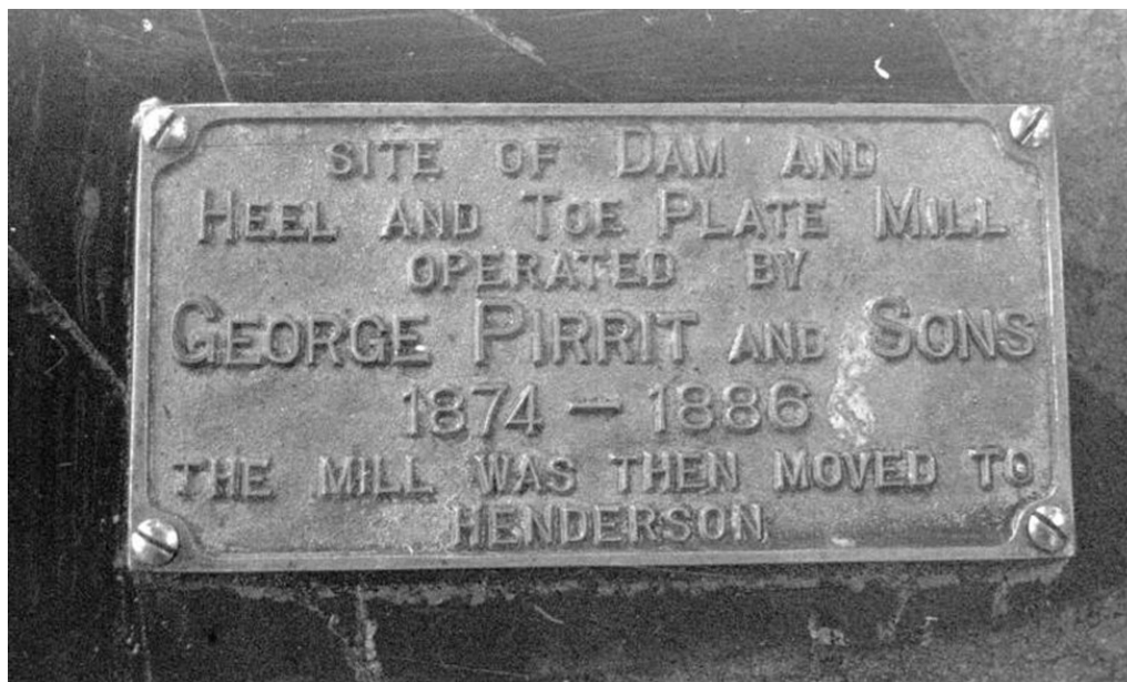
Fig.3. View of plaque at the site of Pirrit's dam and heel and toe plate factory off Razorback Road, Bombay. George owned 140 acres at Pokeno Hill. “the very richest volcanic soil... plenty of water all the year and a 12 feet overshot water wheel, house and outbuildings..” The property was for sale in 1884.

George established a factory for the manufacture of iron toe and heel plates off Razorback Road, Bombay In 1885, a year before this mill closed George moved to a new site in Henderson.